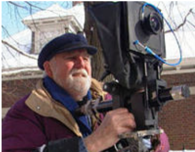
Balthazar Korab Photo courtesy the artist

This in-depth symposium examines the legacy of one of the modern masters of architecture. The three-day event begins with a conversation with architectural photographer Balthazar Korab and features presentations by architectural historians and curators—both local and national—on the reassessment of Saarinen’s work and its impact on contemporary design practice.