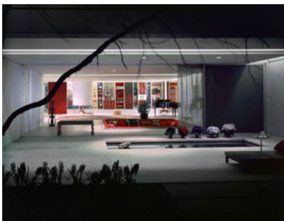
Eero Saarinen Miller House, Columbus, Indiana, circa 1957