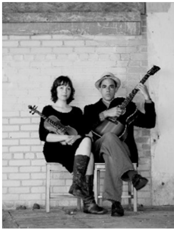
Roma di Luna