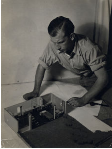
Eero Saarinen with A Combined Living-Dining-Room-Study project model, created for Architectural Forum magazine, circa 1937

and academic and corporate campuses, while the Minneapolis Institute of Arts will present his designs for airports, memorials, and embassies as well as his early work within the context of its modernist design collection.