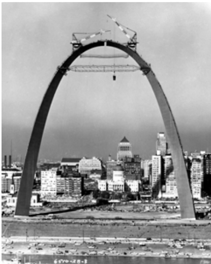
Eero Saarinen United States Jefferson National Expansion Memorial, St. Louis, Missouri, under construction, 1965

AMONG FEATURED PROJECTS ARE CHRIST CHURCH LUTHERAN IN MINNEAPOLIS AND IBM BUILDING IN ROCHESTER