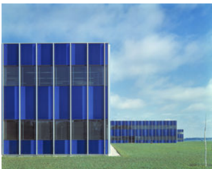
Eero Saarinen IBM Manufacturing and Training Facility, Rochester, Minnesota, circa 1958

Saarinen established his own firm and enjoyed a fame that surpassed that of his father's, attracting and nurturing top talent from around the world, many of whom went on to have significant practices of their own. He achieved international acclaim while working out of a surprisingly modest office in Bloomfield Hills. An intense and immersive environment, the office operated nearly around the clock. Saarinen's practice spanned airports, embassies, national memorials, corporate and academic campuses, churches, private residences, and furniture. Some of his peers criticized him for having a different style for each job, but he shrugged off the criticism, rejecting the dogma of an orthodox modernism by letting the subject and site guide his solutions.